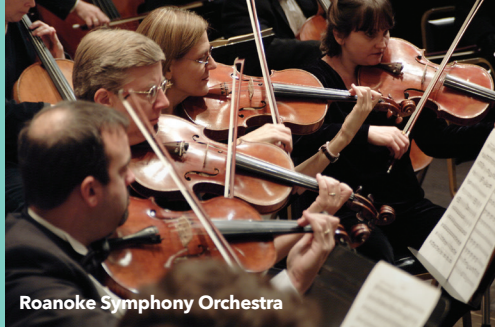
Roanoke Symphony Orchestra