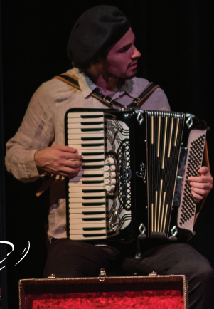
The Grandin Theatre

Executive Director, Roanoke Cultural Endowment